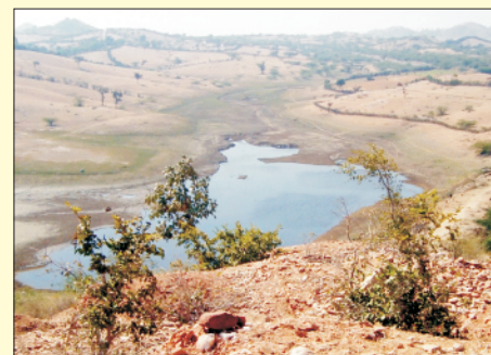
A view of Bernia watershed

Under the development activities, availability of water was upgraded by excavation of existing nadi and the capacity was enhanced from 4000 m 3 to 12500 m 3 . To improve the productivity of kharif crops 263 kg of high yielding paddy (Pusa-Sugandha-5) and 250 kg of urd bean (PU-31) seeds were distributed to the farmers along with 18 q of Urea, 12 q of DAP and 7.5 q of NPS @ 30, 20 and 15 kg/farmer. With the use of improved technologies paddy yield increased from 18 to 36 q ha -1 and for Urd bean from 2.4 to 3.6 q ha -1 . In rabi season 40 q wheat (Raj-4037) and 9.9 q of gram (Pratap Chana-1) seeds were distributed to 100 farmers. To manage soil sodicity gypsum application was suggested and was distributed.