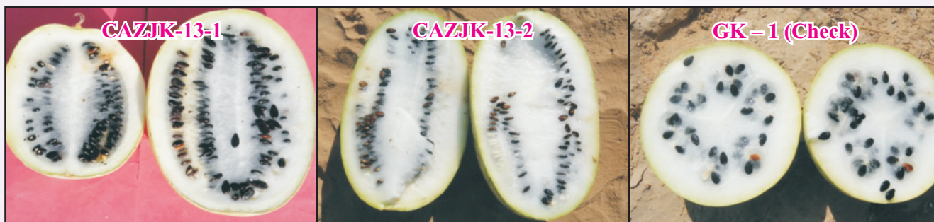
High yielding watermelon genotypes