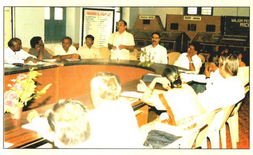
Apex level Training on Rodent Pest Management at National Plant Protection Training Institute, Hyderabad (Feb. 25-27, 2009)