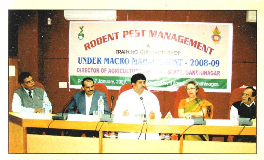
Shri Dilipbhai Sanghani, Hon. Minister of Agriculture, Gujarat addressing the officials during Training cum Workshop on Rodent Pest management in Gandhinagar