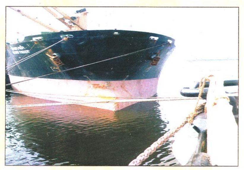
Ship without any Rat guards