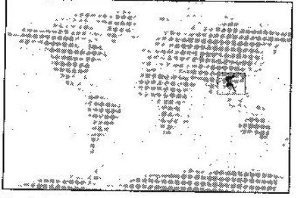
Fig. 1. The parti-colored flying squirrel, Hylopetes alboniger