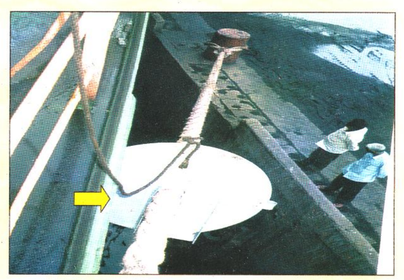
Rat Guard on Mooring ropes